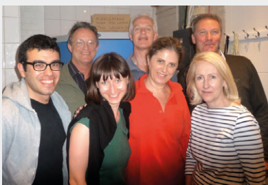
AFME staff volunteering at the Whitechapel Mission in London

AFME recognises it has a responsibility to participate in – and contribute to – the wider community in which we work. We do this by making corporate donations to charities in our local area, supporting individual charitable giving through our matching donations scheme, and encouraging local charitable and community involvement by AFME employees.